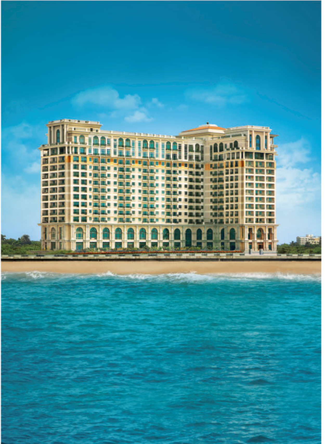
The Leela Palace Chennai