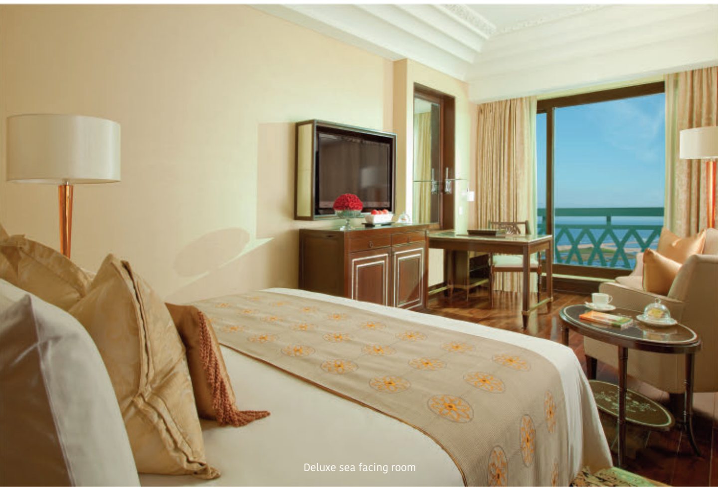
Deluxe sea facing room